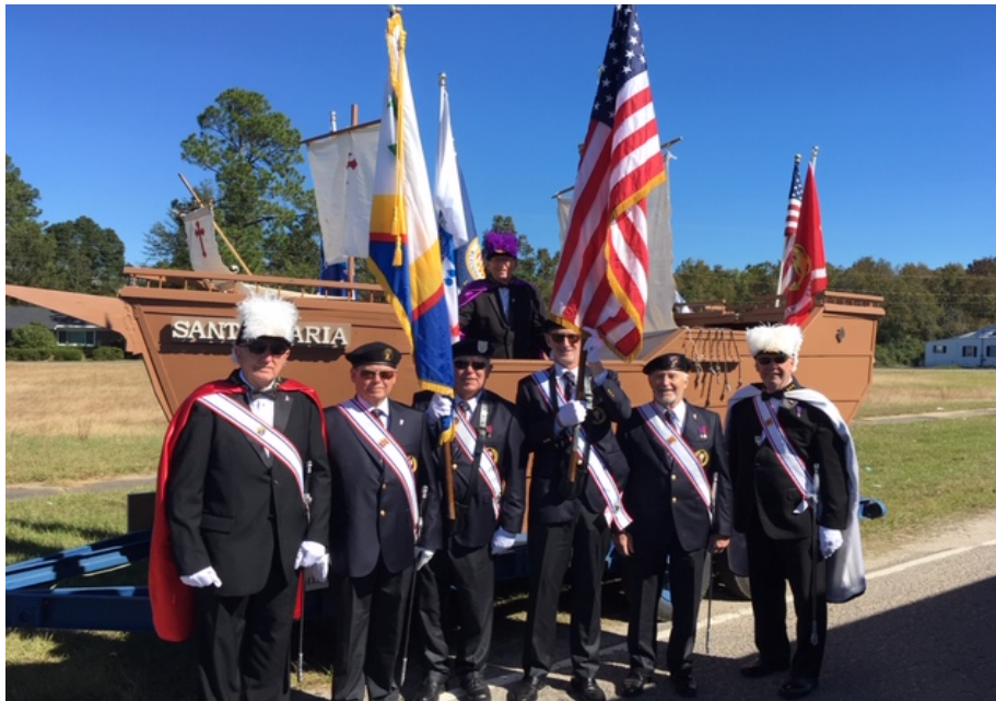
Andrews, SC, Veterans Day Parade, November 3, 2018